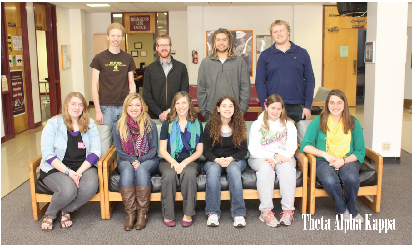
Theta Alpha Kappa