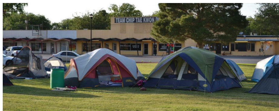
Students camp out at World Village in 2012